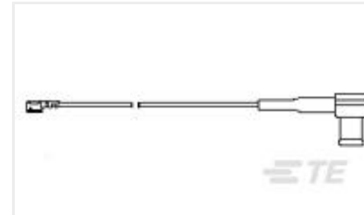
TE Part #2032442-1 C/A, UMCC TO MCX R/A PLUG, 1.37 MM OD