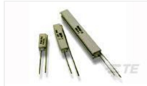
TE Part #3-1623732-0 BCHE 7 W 330R 5%