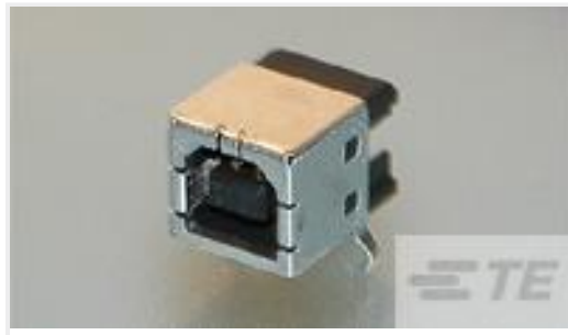
TE Part #292304-1 STD USB TYPE B, R/A, T/H