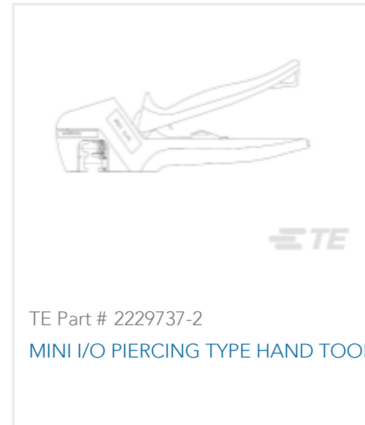
TE Part # 2229737-2 MINI I/O PIERCING TYPE HAND TOOL