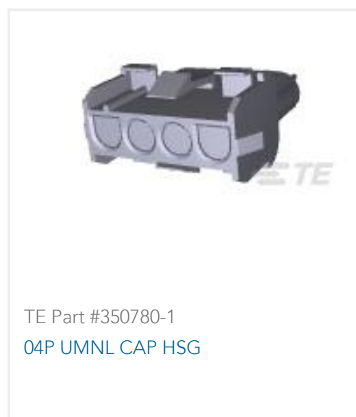
TE Part #350780-1 04P UMNL CAP HSG