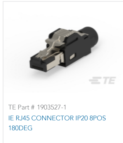
TE Part # 1903527-1 IE RJ45 CONNECTOR IP20 8POS 180DEG