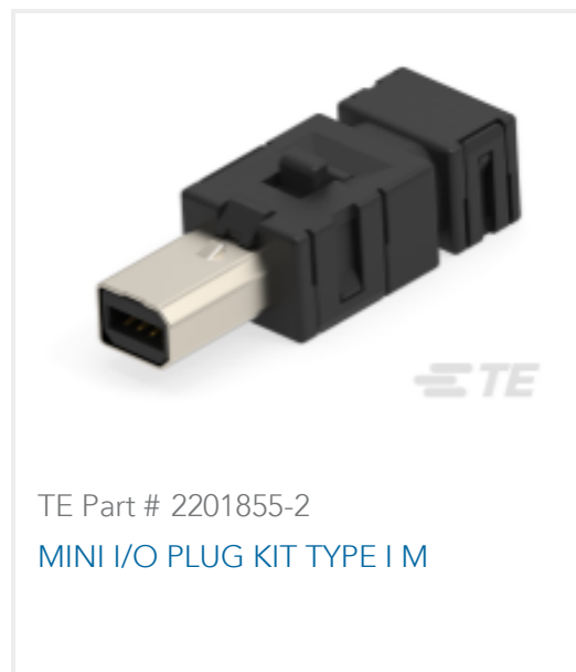
TE Part # 2201855-2 MINI I/O PLUG KIT TYPE I M