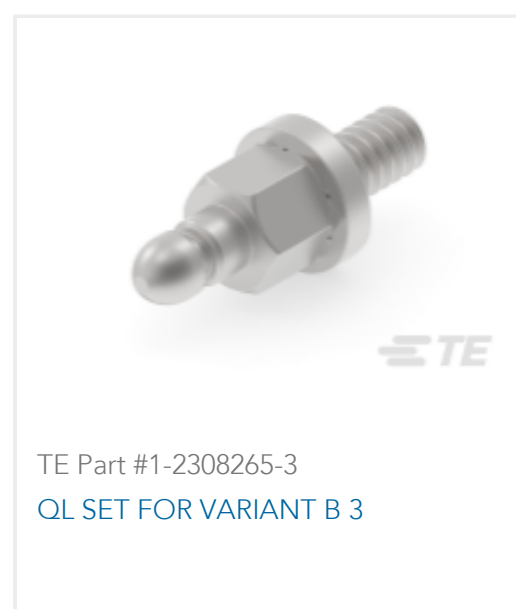
TE Part #1-2308265-3 QL SET FOR VARIANT B 3