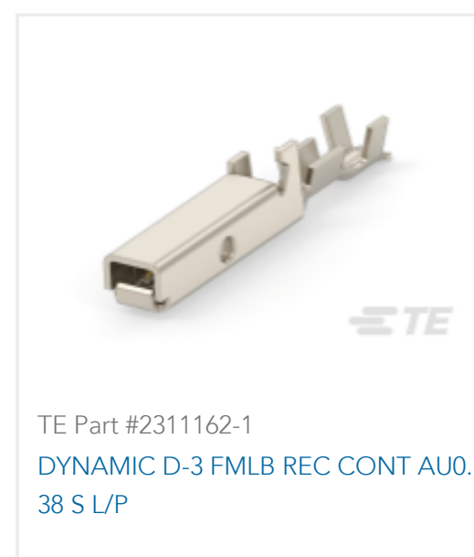
TE Part #2311162-1 DYNAMIC D-3 FMLB REC CONT AU0. 38 S L/P