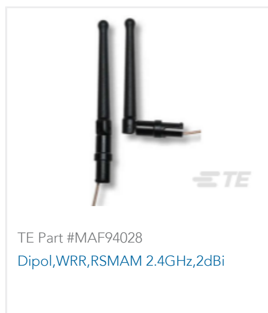
TE Part #MAF94028 Dipol,WRR,RSMAM 2.4GHz,2dBi