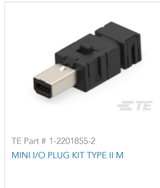
TE Part # 1-2201855-2 MINI I/O PLUG KIT TYPE II M