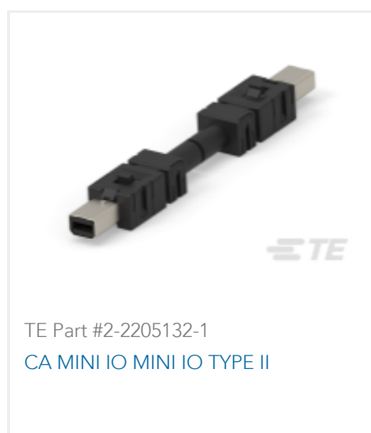
TE Part #2-2205132-1 CA MINI IO MINI IO TYPE II