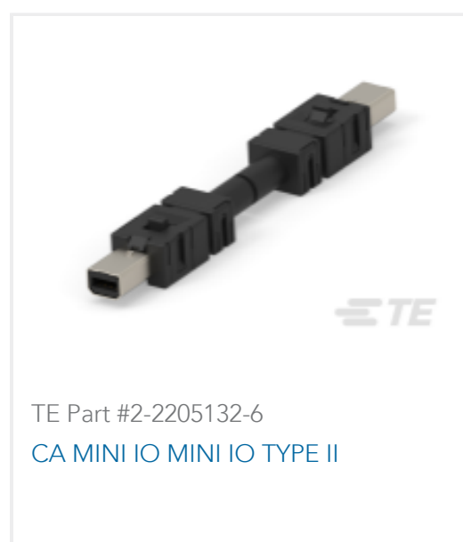
TE Part #2-2205132-6 CA MINI IO MINI IO TYPE II