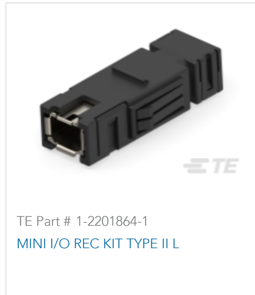
TE Part # 1-2201864-1 MINI I/O REC KIT TYPE II L