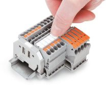
Snapping a marking strip into the marker slot.