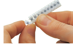
Separating an individual marker from the WMB marker strip – for larger terminal blocks.