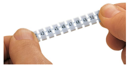
Stretching a WMB marker strip.