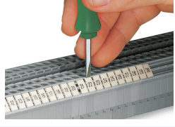
Snapping a marking strip into the marker slot.