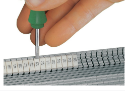
Snapping a WMB marker strip into the marker slot of the double marker carrier.