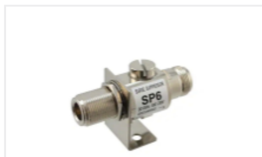
TE Part #SP6-230-BFF Surge, GasWB, DC-6GHz, NFB NF, 230V