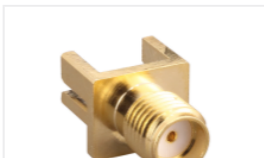
TE Part #L9000277-01 SMA Jack 50 Ohm .031 PCB Edge Mount