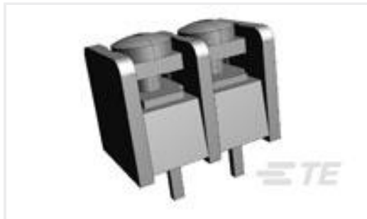
TE Part #2-1437667-4 4DB-P108-02=4DB ASSEMBLY