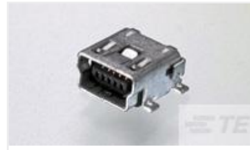
TE Part #1734035-4 MINI USB, TYPE B, R/A, SMT, MYLAR