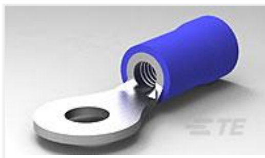
TE Part #34159 TERMINAL,PG R 16-14 6