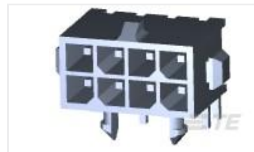
TE Part #3-794618-8 08P MICRO MNL ASSY R/A HDR LF