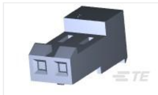
TE Part #3-640428-2 02P MTA156 CONN ASSY 22AWG RED