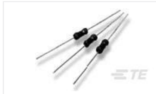
TE Part #1625890-4 2W SM M/OX 5% 100R