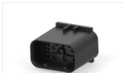
TE Part #964440-1 STIFT-GEH MIX 20P