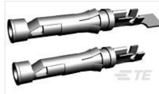
TE Part #1-66358-0 III+ SKT,18-14,30AU/FL,STRIP