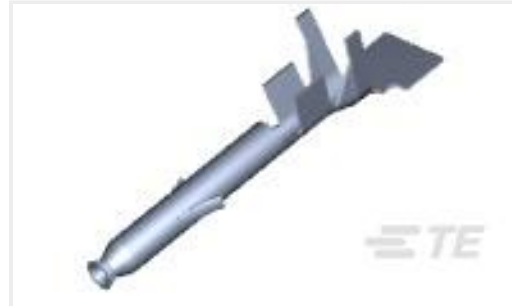
TE Part #770904-4 MINI UMNL SOK CONT 22-18 AWG