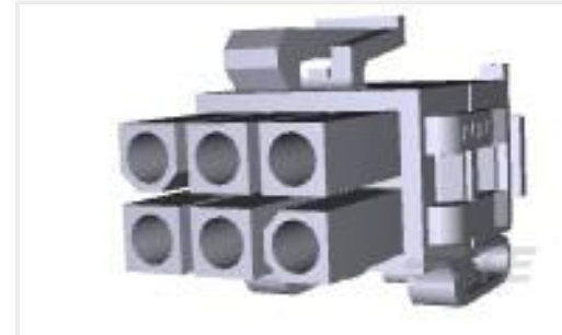
TE Part #794190-1 06P MINI UMNL2 PLUG HSG UL94V0