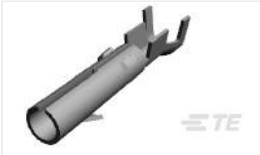
TE Part #163300-8 MATENLOK SOCKET