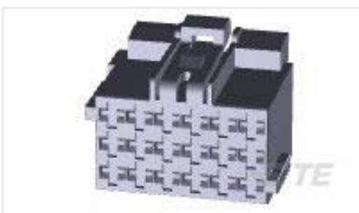
TE Part #1-967622-5 JUN-POW-TIM GEH 12P