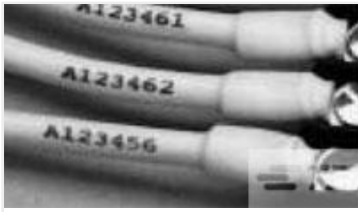
TE Part #5053184028 RNF-100-3/8-9-SP