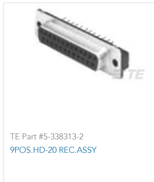
TE Part #5-338313-2 9POS.HD-20 REC.ASSY