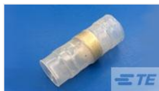
TE Part #690886-000 B-050-00