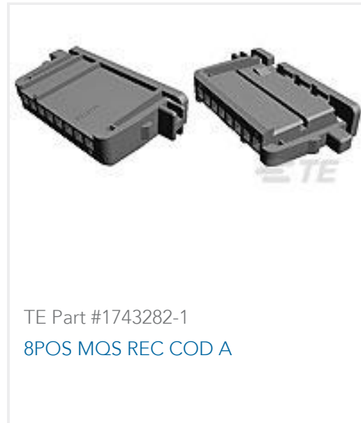
TE Part #1743282-1 8POS MQS REC COD A