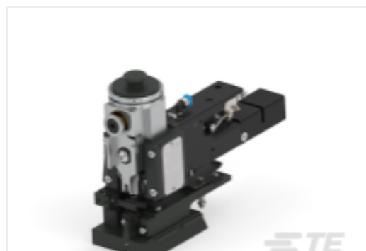
TE Part # 2150235-1 OCEAN_2.0_Applicator-E-110F180F-REM