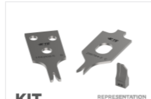
TE Part # 7-2150235-7 OCEAN_2.0_SPARE_PART_KIT-110F180F