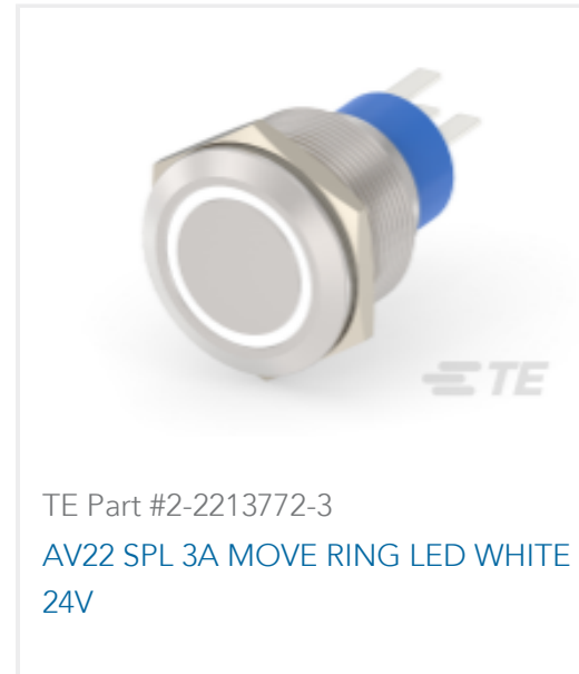
TE Part #2-2213772-3 AV22 SPL 3A MOVE RING LED WHITE 24V