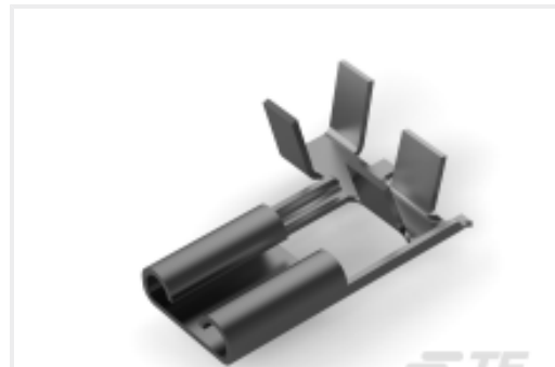
TE Part # 180398-5 FF 250 REC 1-2.5MM2 TPPB