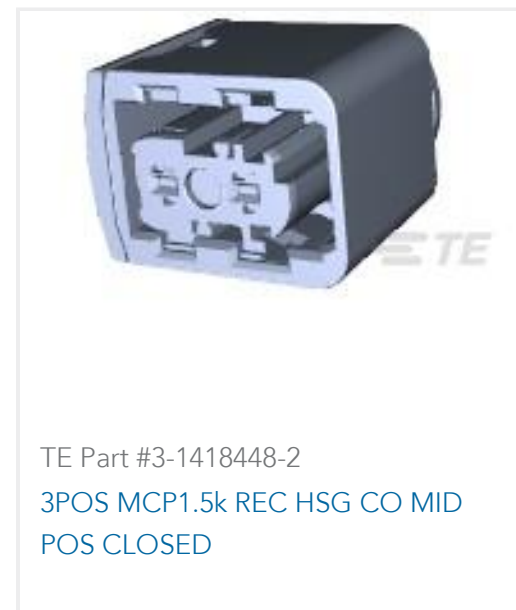
TE Part #3-1418448-2 3POS MCP1.5k REC HSG CO MID POS CLOSED