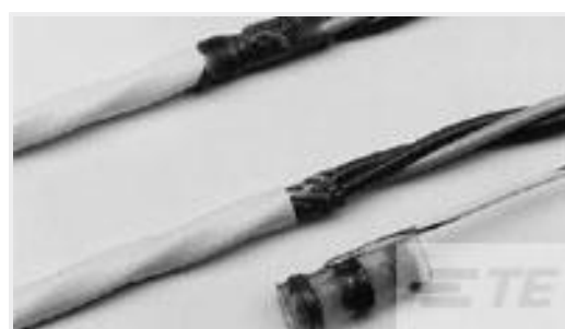
TE Part #624037-000 D-101-34