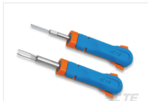
TE Part # 4-1579007-3 EXTRACTION TOOL KIT