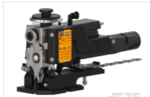
TE Part # 2150235-2 OCEAN_2.0_Applicator-E-110F180F-REA