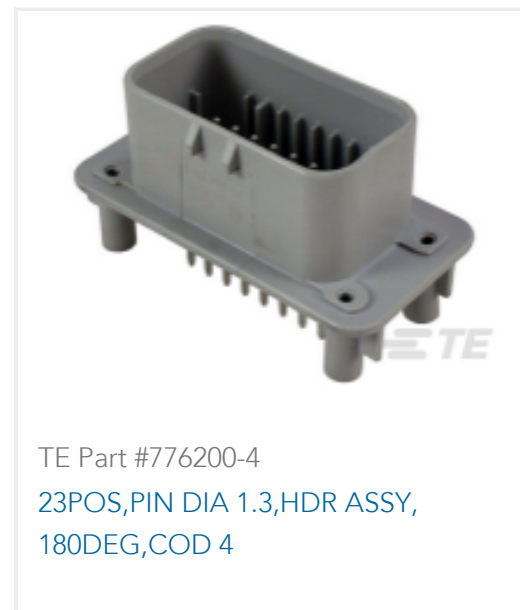
TE Part #776200-4 23POS,PIN DIA 1.3,HDR ASSY, 180DEG,COD 4