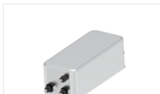
TE Part #801262-SF FN2070-36-08