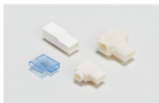
Crimp Terminal Housings(190)