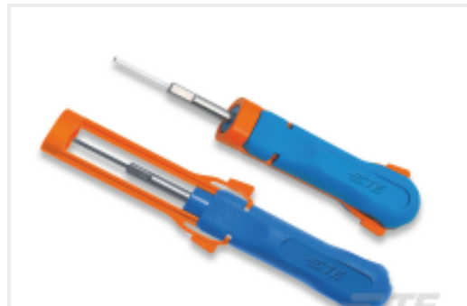
TE Part # 1-1579007-4 EXTRACTION TOOL