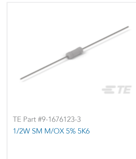
TE Part #9-1676123-3 1/2W SM M/OX 5% 5K6