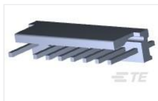
TE Part #641936-6 09P MTA156 HDR ASSY F/L W/O#8