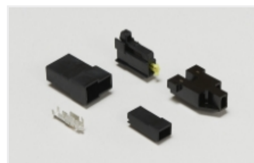
Magnet Wire Terminals(1)