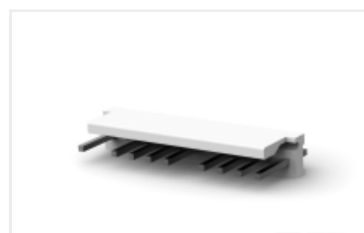
TE Part #643704-8 11P MTA156 HDR ASY FL/STR,OMIT