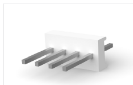
TE Part #CAT-104MTA-PVUNH PCB Header: Polyester, Vertical, Unshrouded, No Mating Alignment