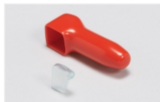
Insulation Boots & Sleeves(16)