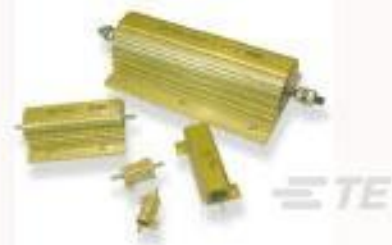
TE Part #2-1630012-8 HSC150 22R 5%