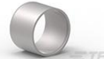
TE Part #1587828-3 INNER FERRULE, SIZE C, HVA280-2PI