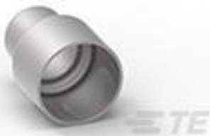
TE Part #1587829-3 OUTER FERRULE, SIZE C, HVA280-2PI