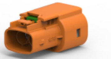
TE Part #1-2103177-1 PLUG ASSY, KEY A, TA, HVA280-2PHI XE