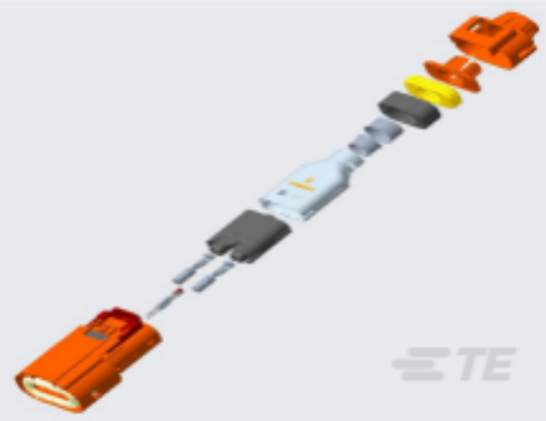
TE Part #YHV280-2PM-P-4MM-B HVA280-2phtm,pass,4sqmm,Key B