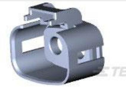
TE Part #1587827-3 CABLE SEAL RETAINER, SIZE C, HVA280-2PI