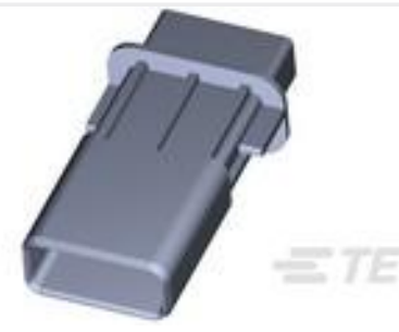
TE Part # 2103321-1 3p Inner Hsg, Split Hdr, Key A, HVA280