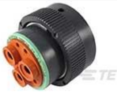
TE Part #HDP26-24-7SN-C038 PLG, 7P, BLK, N, 4AWG, 4/16, S