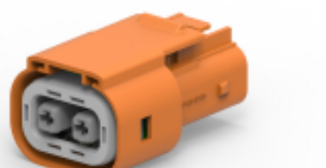
TE Part #1-2103177-2 PLUG ASSY, KEY B, TA, HVA280-2PHI XE