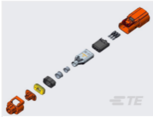
TE Part # YHVA280-3PXM-B-000 HVA280-3pxm XE,Key B