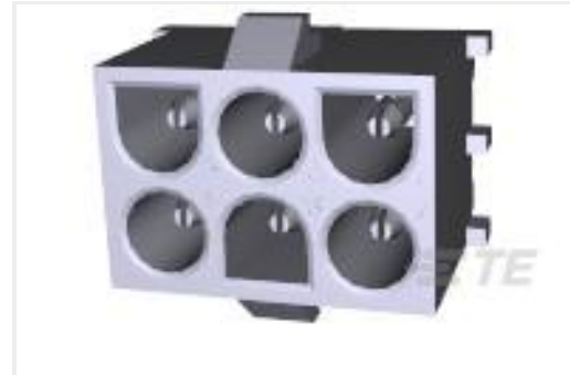
TE Part #350732-4 06P UMNL PIN HDR ASSY 94VO LF