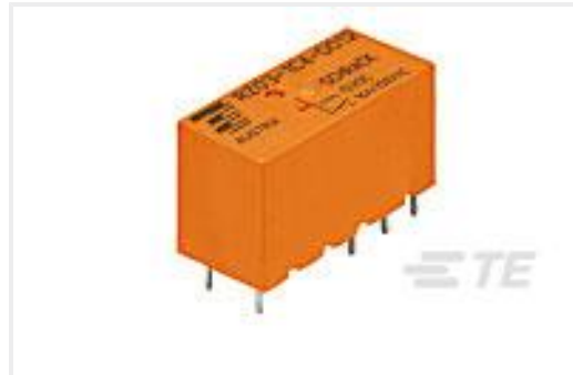
TE Part #4-1415899-7 RZ03-1A3-D005