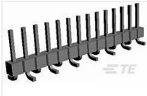
TE Part #1241150-5 5P MOD II BREAK AWAY HDR , SMD, BLISTER