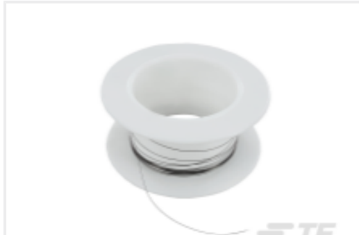
TE Part #R-12167-21 TC,MICRO,BIFILAR,T,44AWG,71.0L, POLYMER