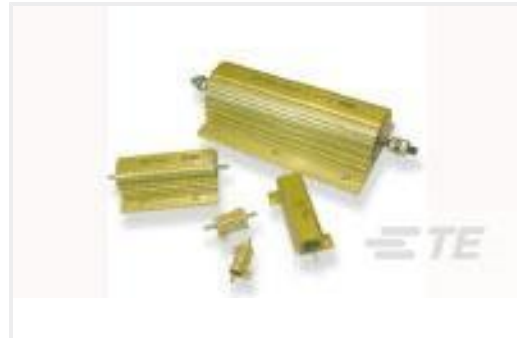
TE Part #5-1625971-3 HSA25 4K7 5%