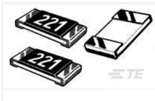
TE Part #1-2176230-9 3522 27R 5% 3W