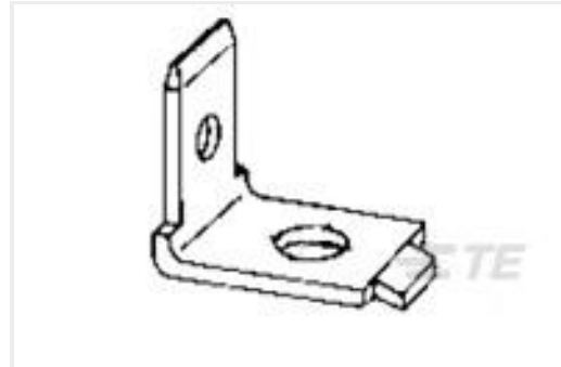
TE Part #170001-3 187 FASTON,TAB,TPBR