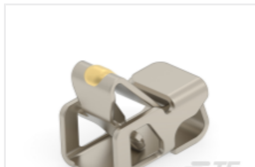
TE Part #2336713-2 SPRING FINGER 1.45H