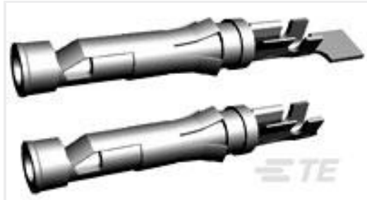
TE Part #1-66358-6 III+ SKT,18-14,TIN ,STRIP