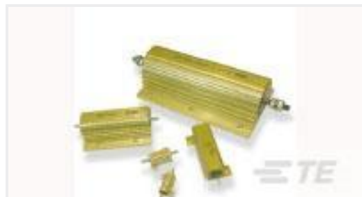
TE Part #1-1625984-8 HSA50 1K2 5%