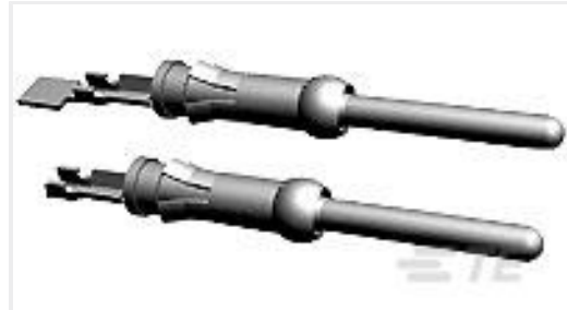
TE Part #1-66359-4 III+ PIN,18-14,TIN,STRIP