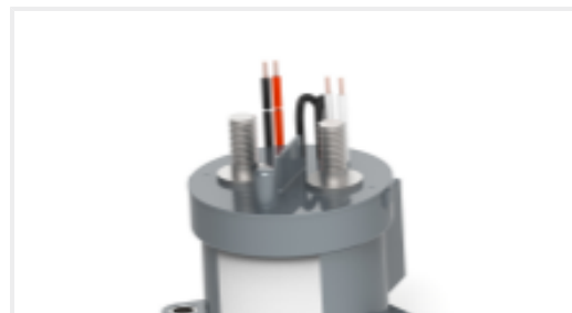
TE Part #2-2071411-1 IHV250HAANA