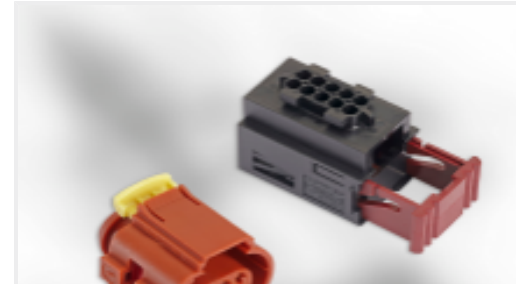
TE Part #CAT-T4827-CH8172 Timer Connector Housing