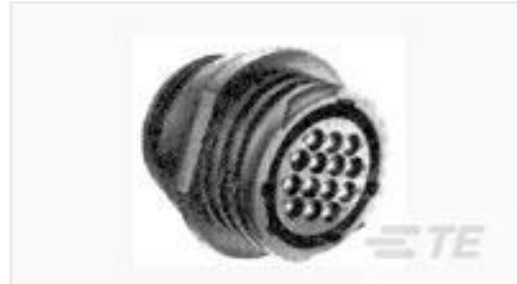
TE Part #206043-5 CPC RECPT ASSEMBLY SIZE 17-14