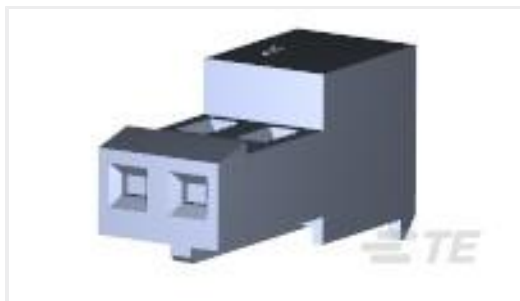
TE Part #3-640440-2 02P MTA100 CONN ASSY 22AWG RED