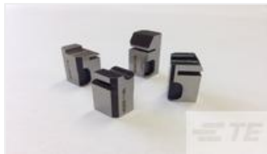
TE Part #1-690463-6 FLOATING SHEAR, REAR