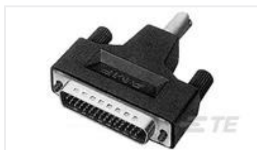
TE Part #1658678-1 KIT,HDP-22,ENCLSUR,PLUG,SIZE 1