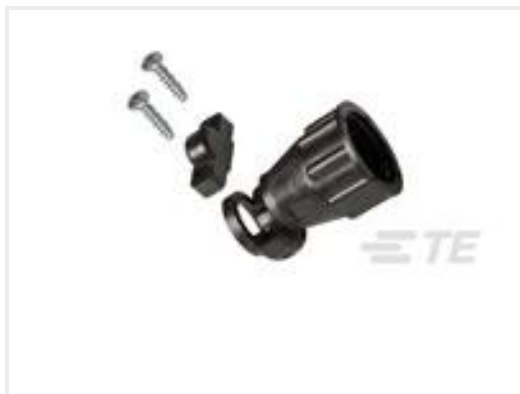
TE Part #1-206062-4 CABLE CLAMP KIT #11