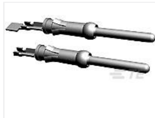
TE Part #66361-4 PIN ASSEMBLY, LOOSE PIECE, TYPE III+