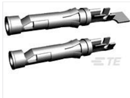
TE Part #66360-4 SOCKET ASSEMBLY, LOOSE PIECE, TYPE III+