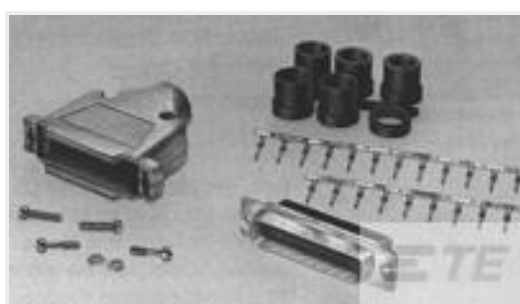
TE Part #749805-8 KIT,HDP-20,PLUG,SIZE 2, 15 POS