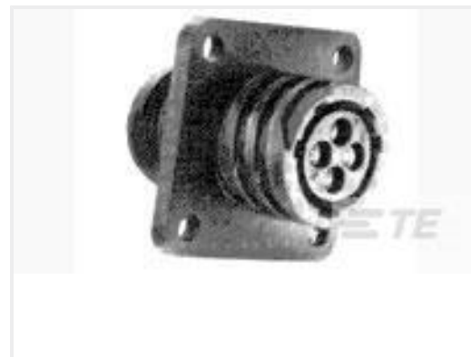
TE Part #206430-3 CPC RECPT ASSEMBLY SIZE 11-4