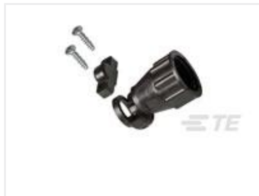
TE Part #1-206062-6 CABLE CLAMP KIT #11