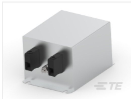
TE Part #806190-SF FN2412-25-33