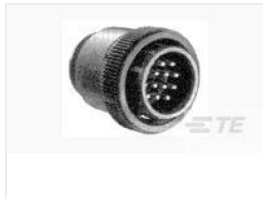
TE Part #206429-1 CPC PLUG ASSY, 11-4, REV SEX