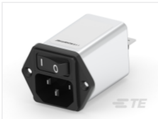
TE Part #811698-SF FN9264-10-06