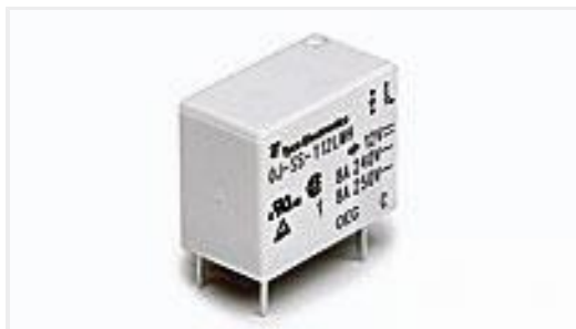
TE Part #1-1461116-5 OJT-SH-124DM,000