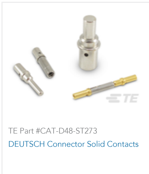
TE Part #CAT-D48-ST273 DEUTSCH Connector Solid Contacts