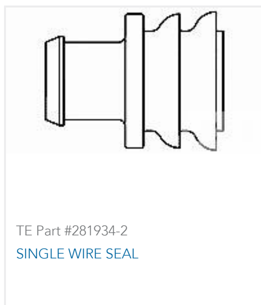
TE Part #281934-2 SINGLE WIRE SEAL