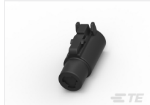
TE Part #DTHD06-1-8S PLG, 1P, BLK, N, SIZE 8