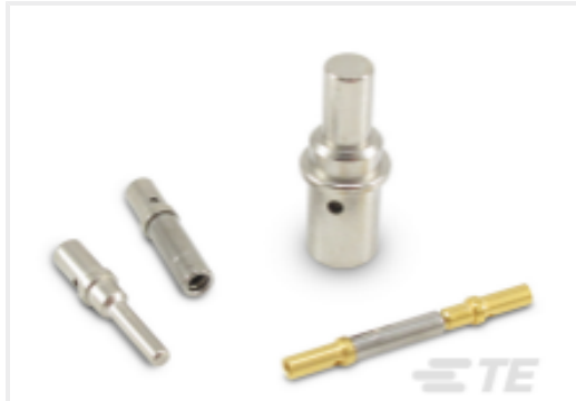
TE Part #CAT-D48-ST273 DEUTSCH Connector Solid Contacts