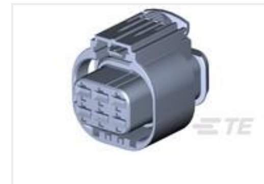
TE Part #1745078-1 AMP MCP 2.8K - REC. HOUSING