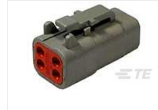
TE Part #DTM06-4S PLG, 4P, GRY, N