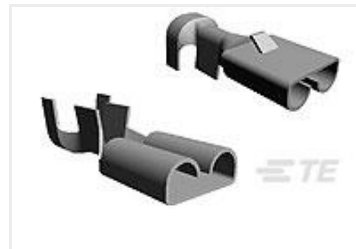
TE Part #180384-2 FF 250 REC 4-6MM2 PTBR LP