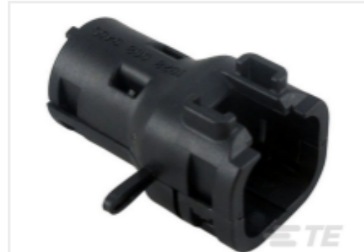
TE Part #1028-008-0405 BKSHL, 4P, BLK, PLG, ST, NW 8.5