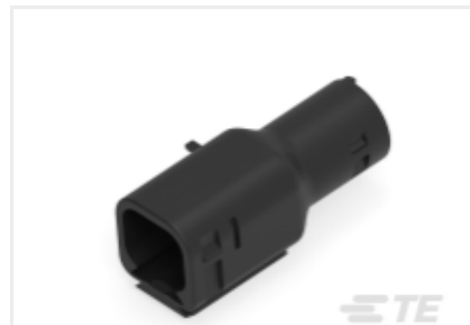
TE Part #1028-027-0405 BKSHL, 4P, BLK, REC, ST, NW 7.5/8.5