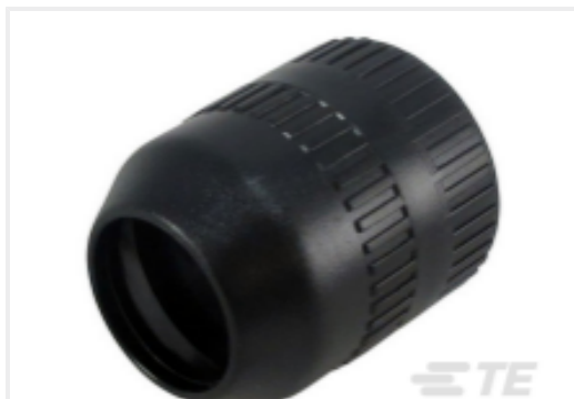
TE Part #M902-2054 COMP NUT, 6/9/24SZ,CBL SZ .570-.710,HD10