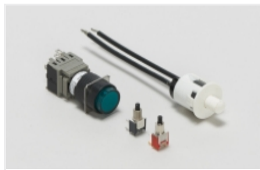
Push Button Switches(18)