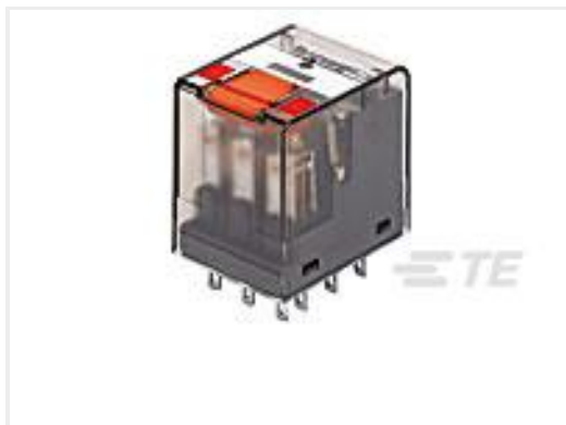
TE Part #7-1415541-0 PT570LC4