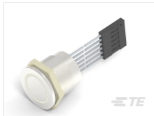
TE Part #2342839-4 AVP19M FLAT S16 RGB R 500MM/1X6