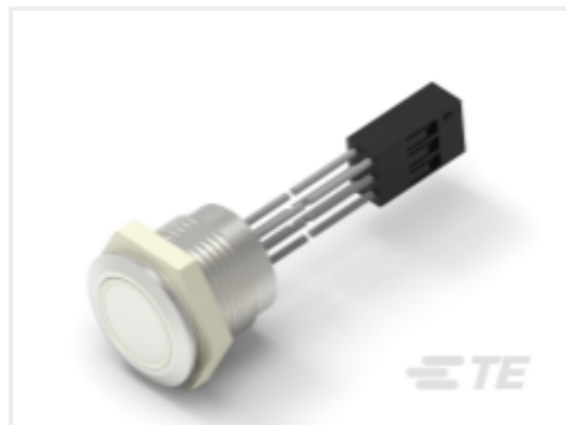
TE Part #2342832-3 AVC16L FLAT S04 RGB R 500MM/2X3