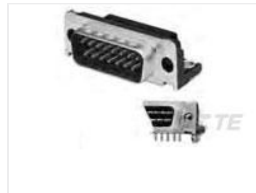
TE Part #5747842-3 25 MSFL PLUG RA 318 (IN,FM,BL)