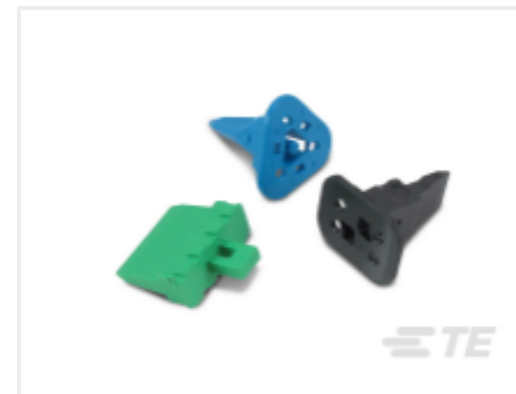
TE Part #CAT-D487-W416 WedgeLocks: DEUTSCH DT