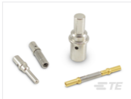
TE Part #CAT-D48-ST273 DEUTSCH Connector Solid Contacts