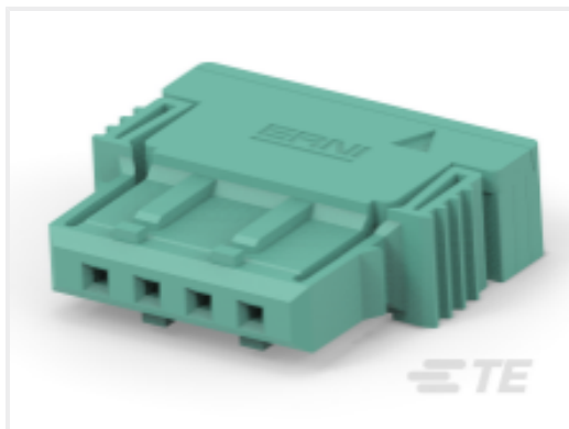
TE Part #384455-E SRCBUG A 2,54 2 4 CSI 164 E1 ADV J 2 324