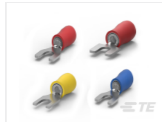
TE Part #CAT-P592-SP118 PIDG Spade Tongue Terminals