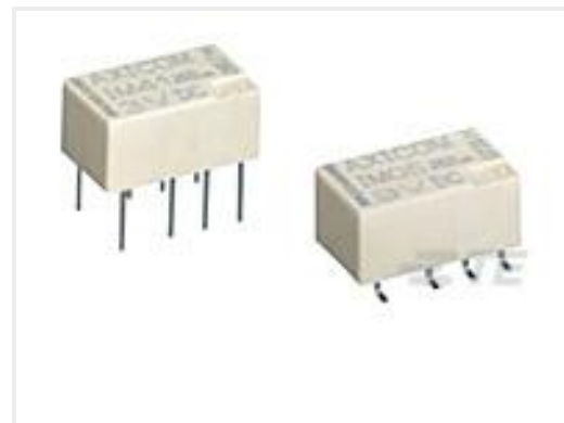
TE Part #1462038-3 IM05CGR=IM RELAY 140mW 9V HDV