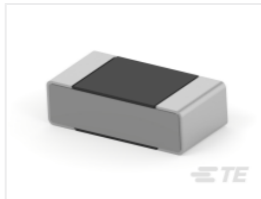
TE Part #3-2176263-1 RN 0402 49K9 0.1% 10PPM 5K RL