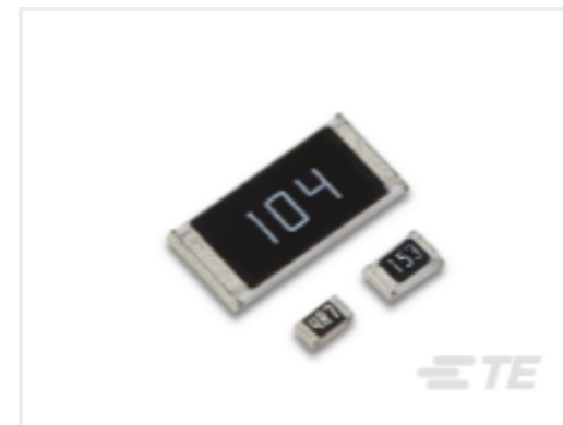
TE Part #3-2176339-4 CRGCO 0603 5K6 1%