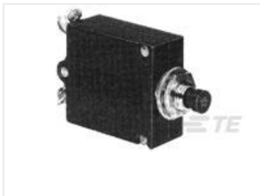
TE Part #7-1393246-6 W23-X1A1G-50=W23/W31