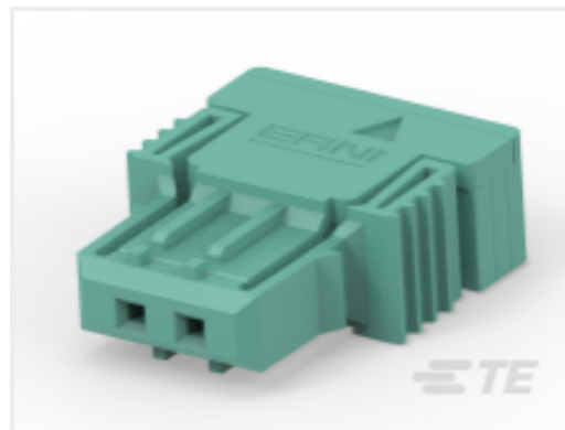
TE Part #364200-E SRCBUG A 2,54 2 2 CSI 164 E1 ADV J 2 324