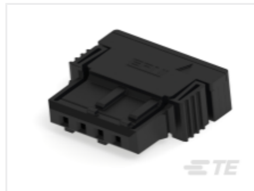
TE Part #384453-E SRCBUG A 2,54 2 4 CSI 112 E1 ADV J 2 324