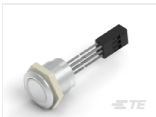
TE Part #2342832-1 AVC16L FLAT AIO RGB R 500MM/2X3