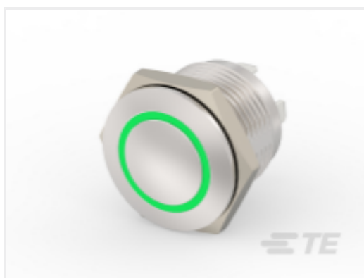
TE Part # 2213774-7 AV16 SPM 0.4VA FIX RING LED GREEN 12V