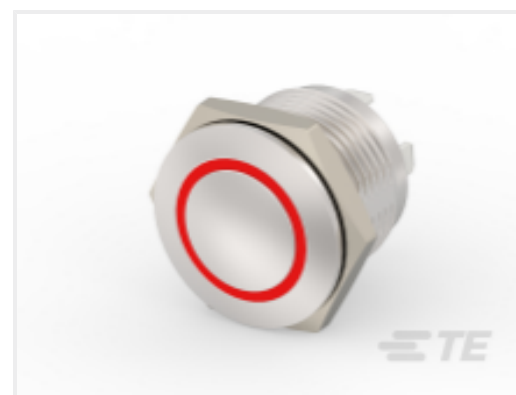
TE Part # 2213774-3 AV16 SPM 0.4VA FIX RING LED RED 12V