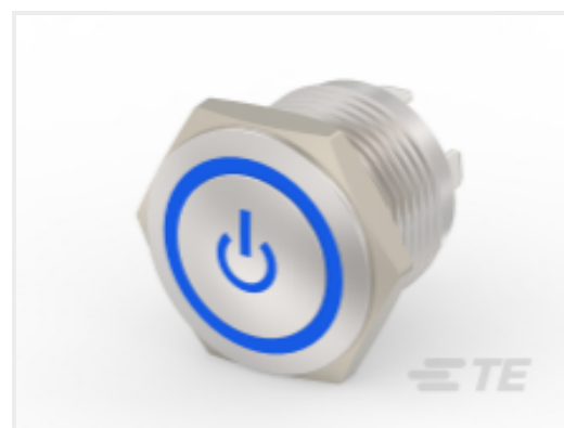
TE Part # 2213775-9 AV16 SPM 0.4VA POWER LED BLUE 12V