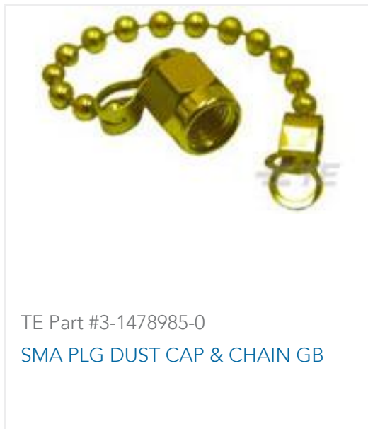
TE Part #3-1478985-0 SMA PLG DUST CAP & CHAIN GB