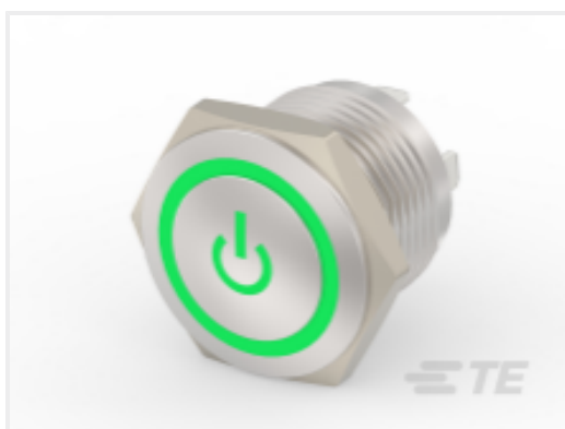
TE Part # 2213775-7 AV16 SPM 0.4VA POWER LED GREEN 12V