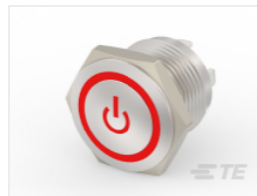
TE Part # 2213775-3 AV16 SPM 0.4VA POWER LED RED 12V