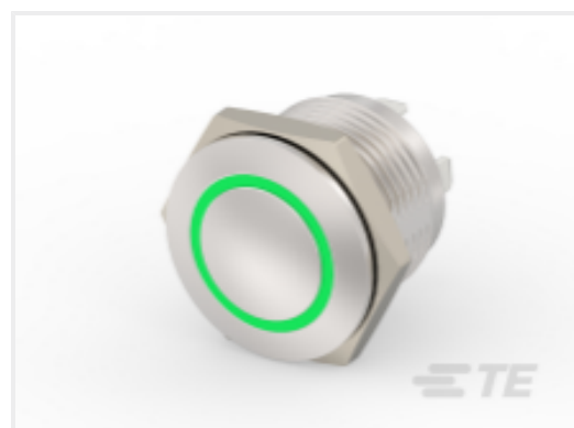
TE Part # 2213774-7 AV16 SPM 0.4VA FIX RING LED GREEN 12V