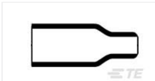
TE Part #474319-000 202A132-25/86-0