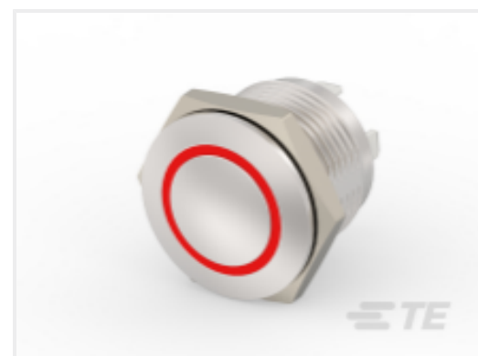
TE Part # 2213774-3 AV16 SPM 0.4VA FIX RING LED RED 12V