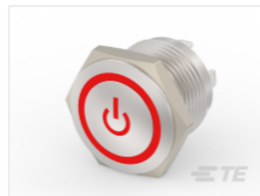
TE Part # 2213775-3 AV16 SPM 0.4VA POWER LED RED 12V