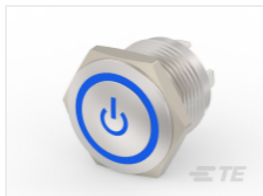
TE Part # 2213775-9 AV16 SPM 0.4VA POWER LED BLUE 12V