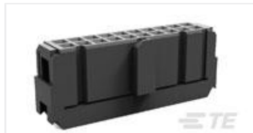
TE Part #1658621-1 10 NOVO MIL/CTR 15DP, LEAD FREE