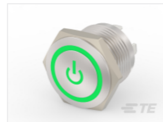
TE Part # 2213775-7 AV16 SPM 0.4VA POWER LED GREEN 12V