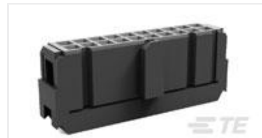
TE Part #1658621-9 40 NOVO MIL/CTR 15DP, LEAD FREE