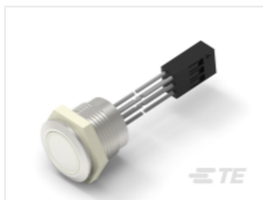
TE Part #2342832-9 AVC16M FLAT S16 RGB R 500MM/2X3