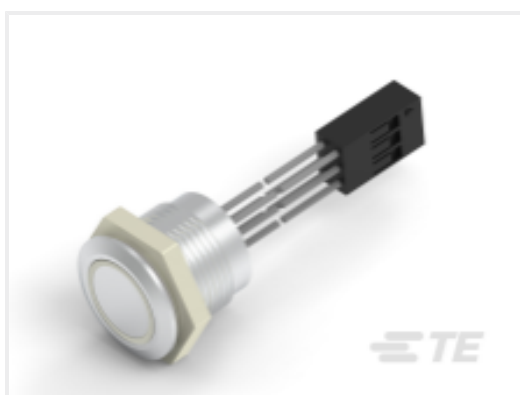
TE Part #2342832-7 AVC16M FLAT AIO RGB R 500MM/2X3