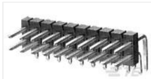
TE Part #5-826634-0 MOD2 PIN HEADER 50P