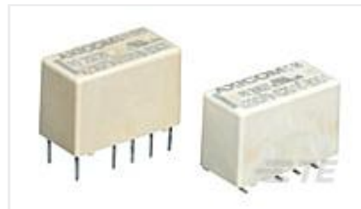
TE Part #1-1393788-6 V23079A1005B301