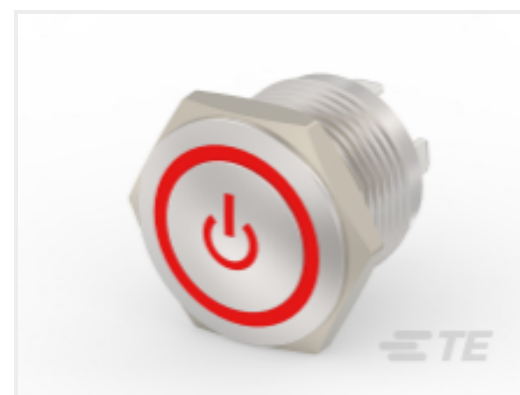
TE Part # 2213775-3 AV16 SPM 0.4VA POWER LED RED 12V