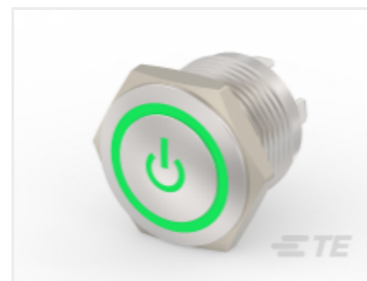
TE Part # 2213775-7 AV16 SPM 0.4VA POWER LED GREEN 12V