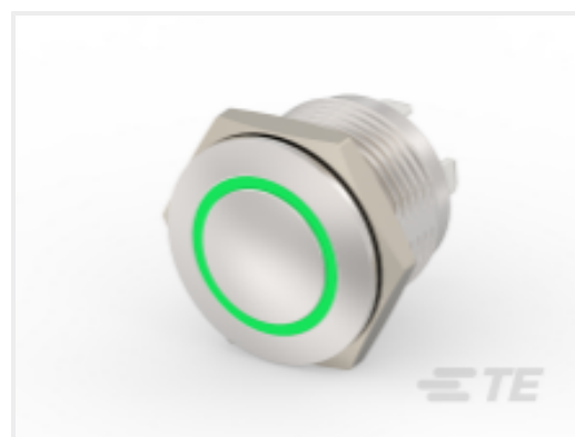
TE Part # 2213774-7 AV16 SPM 0.4VA FIX RING LED GREEN 12V