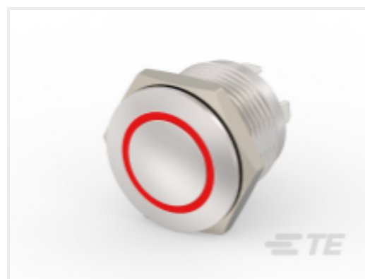
TE Part # 2213774-3 AV16 SPM 0.4VA FIX RING LED RED 12V