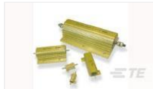
TE Part #3-1625999-3 HSC100 3R3 5%