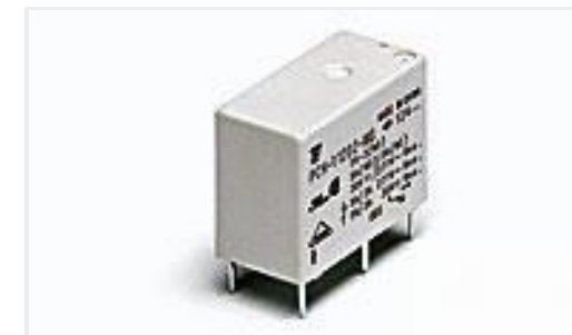
TE Part #9-1440003-3 PCH-112D2H,000