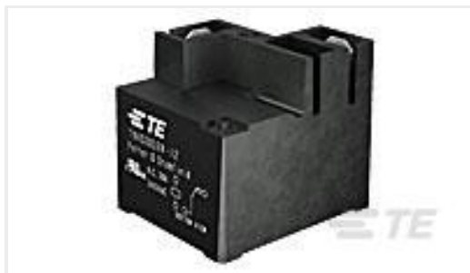
TE Part #1-1393210-3 T9AS1D12-12