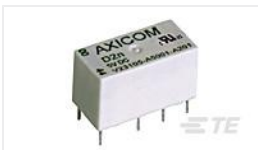
TE Part #9-1393792-0 V23105A5005A201