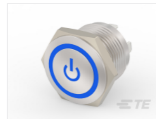
TE Part # 2213775-9 AV16 SPM 0.4VA POWER LED BLUE 12V