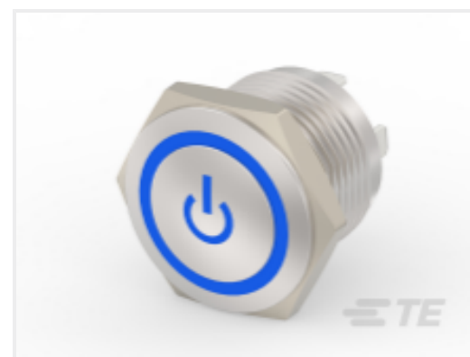
TE Part # 2213775-9 AV16 SPM 0.4VA POWER LED BLUE 12V