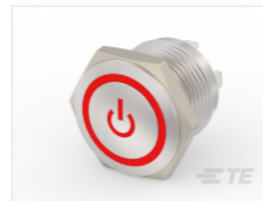
TE Part # 2213775-3 AV16 SPM 0.4VA POWER LED RED 12V