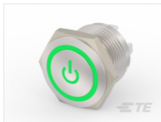
TE Part # 2213775-7 AV16 SPM 0.4VA POWER LED GREEN 12V