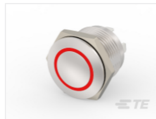
TE Part # 2213774-3 AV16 SPM 0.4VA FIX RING LED RED 12V