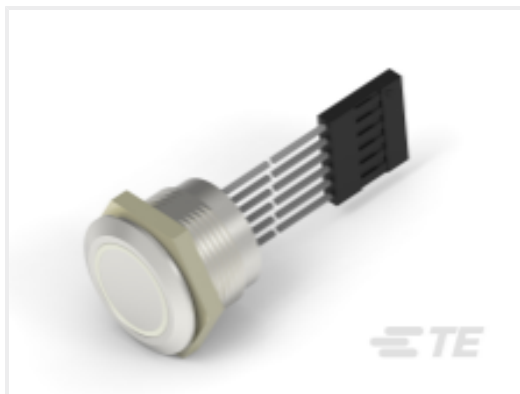
TE Part #2342834-5 AVC19L FLAT S16 RGB R 500MM/1X6