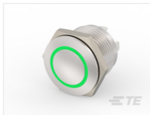
TE Part # 2213774-7 AV16 SPM 0.4VA FIX RING LED GREEN 12V