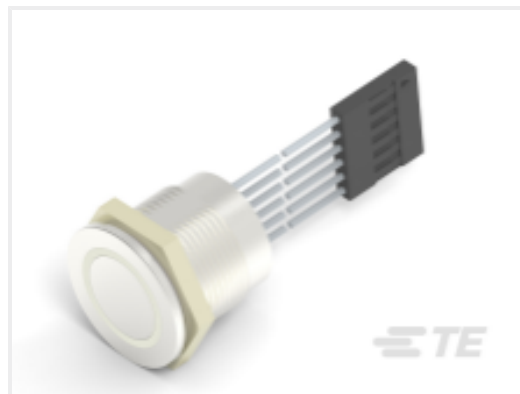
TE Part #2342839-4 AVP19M FLAT S16 RGB R 500MM/1X6