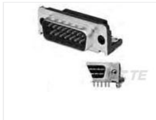
TE Part #5747842-3 25 MSFL PLUG RA 318 (IN,FM,BL)