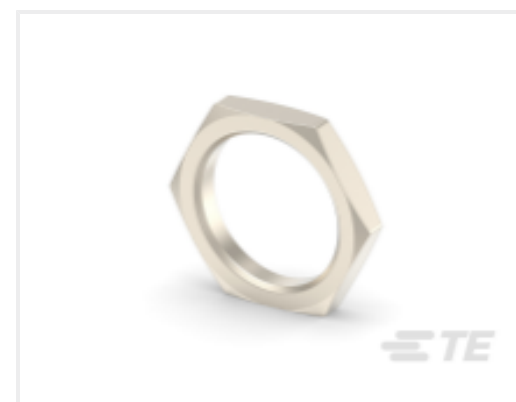
TE Part # 2368790-1 Nut, Hex, 16mm Anti-Vandal