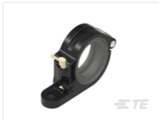
TE Part #EM7083-000 THA-PDKG-13