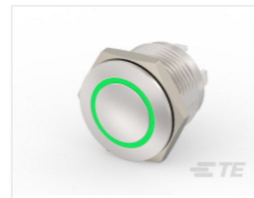
TE Part # 2213774-7 AV16 SPM 0.4VA FIX RING LED GREEN 12V