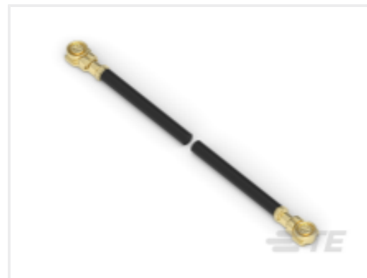
TE Part #1-2016698-0 UMCC CA, GEN4-GEN4,1.13,L45MM, BK