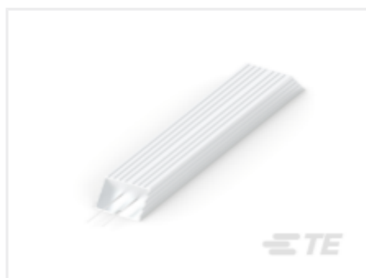
TE Part #2176510-2 CJP 500W 1R8 5% Lead