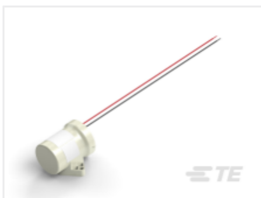
TE Part #2071407-1 IHV50A4ANG