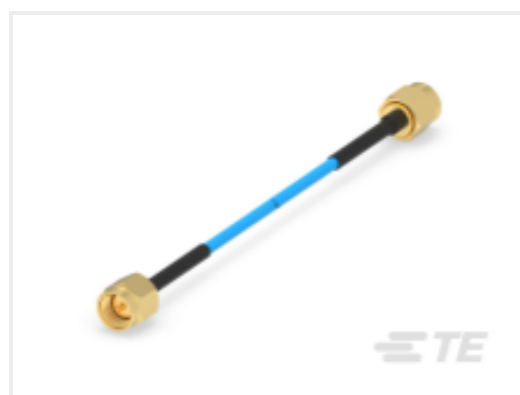
TE Part #2479976-3 SMA M to SMA M Str 18G Flexible.086 36"