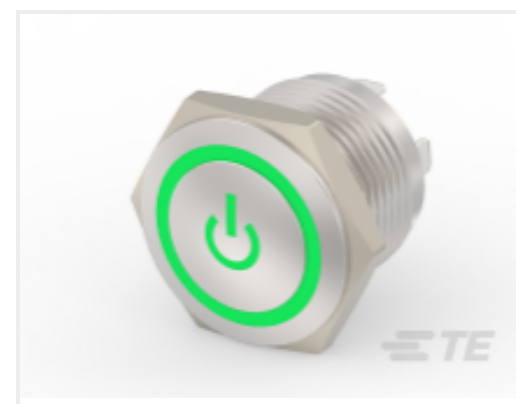
TE Part # 2213775-7 AV16 SPM 0.4VA POWER LED GREEN 12V