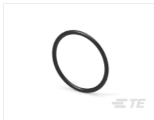
TE Part # 2369024-1 O-Ring, 16mm Anti-Vandal