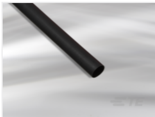
TE Part #NB07106001 BATTU-20.1/8.9-A1-0-39MM