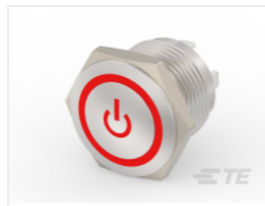
TE Part # 2213775-3 AV16 SPM 0.4VA POWER LED RED 12V