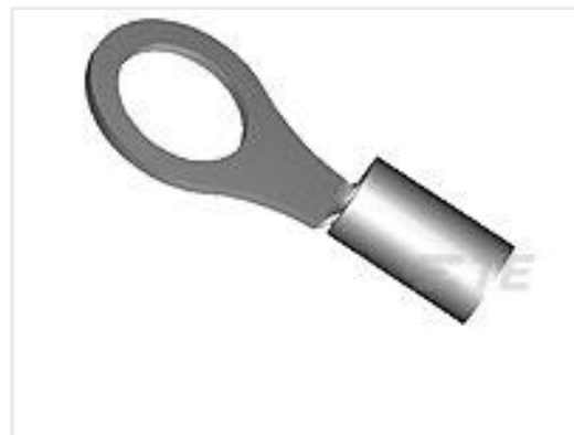
TE Part #726343-1 SO-RINGZUNGE D46234