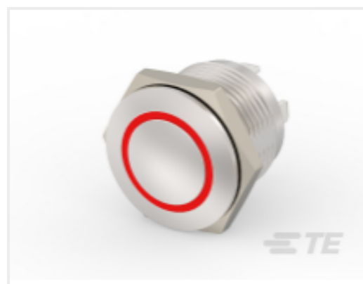
TE Part # 2213774-3 AV16 SPM 0.4VA FIX RING LED RED 12V