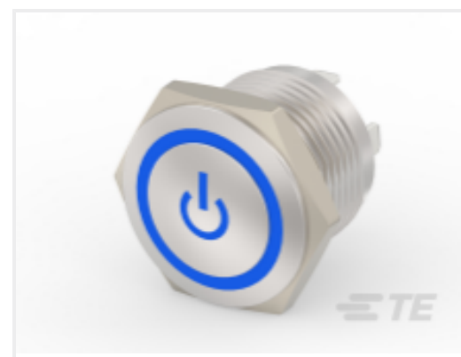
TE Part # 2213775-9 AV16 SPM 0.4VA POWER LED BLUE 12V