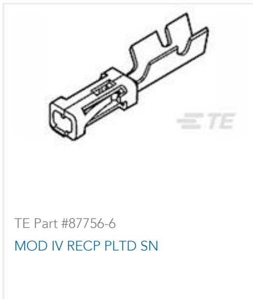
TE Part #87756-6 MOD IV RECP PLTD SN