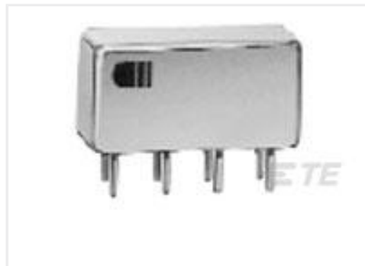
TE Part #1-1617039-8 HMS1201S004 = 2100 HMS RELAY