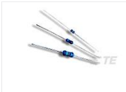
TE Part #1-1676913-7 YR1 0.1% 1K5