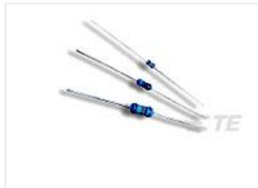
TE Part #7-1676914-3 YR1 0.1% 60K4