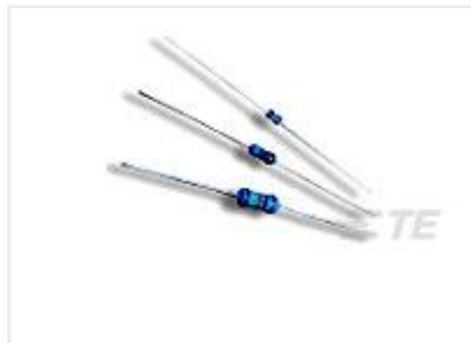
TE Part #2-1676914-2 YR1 0.1% 3K83