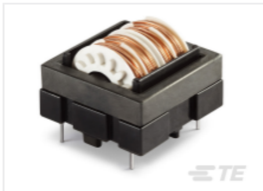
TE Part #801080-SF EH24-0.8-02-18M