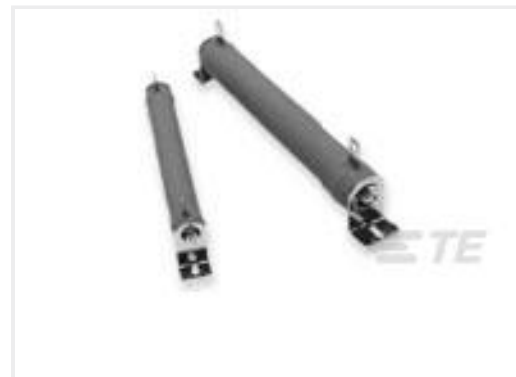
TE Part #1879453-1 TE 1000W 1R0 5% Bracket