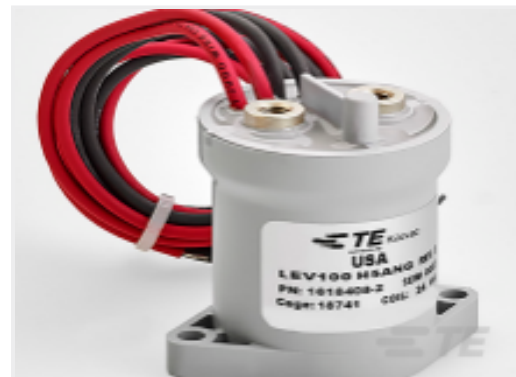
TE Part #1618408-2 LEV100H5CNG = CONTACTOR WITH AUX SPST