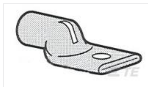
TE Part #328144 TERMINAL,AMPOWER 6 3/8