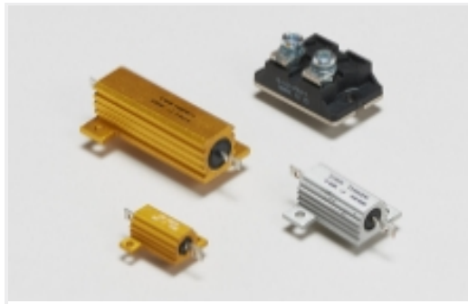
Chassis Mount Resistors(667)