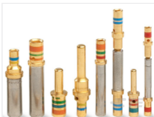
TE Part #2560-201-2031L CONT PIN