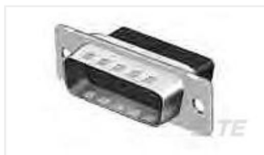
TE Part #167292-1 09P.HDP20 PLUG ASSY