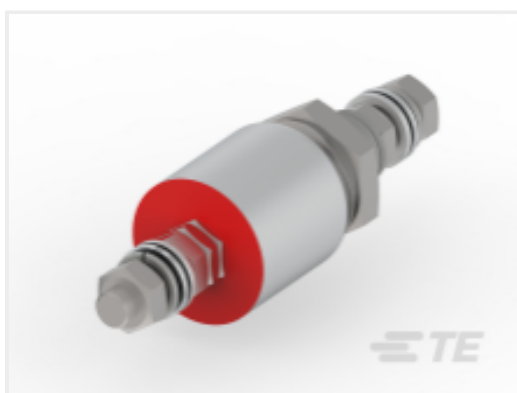
TE Part #801797-SF FN7510-100-M8