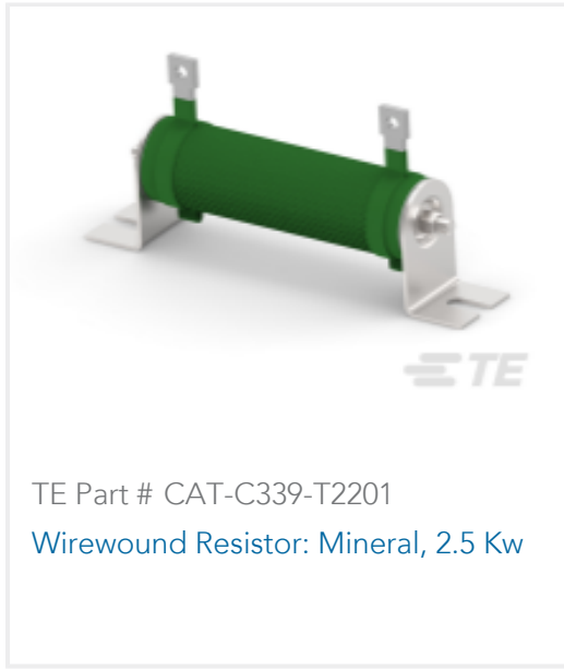
TE Part # CAT-C339-T2201 Wirewound Resistor: Mineral, 2.5 Kw