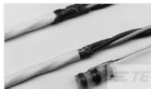
TE Part #CJ8361-000 S200-3-W2-22-9