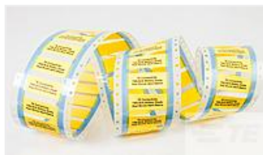
TE Part #9422810001 TMS-SCE-3/8-2.0-9