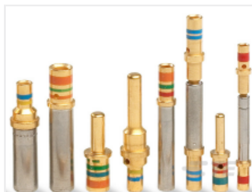
TE Part #2562-201-2031L CONT SOC ASSY